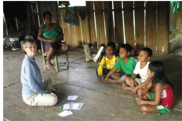
Máihiki language lessons in Nueva Vida in July.

Since 1996, Cabeceras' fieldworkers have worked with, or on behalf of, Nanti, Iquito, Matsigenka, Máihùnà, Omagua, Muniche, Mashco Piro, Katsakáti, A'ewa, and Sápara people and/or communities, through our humanitarian aid and research projects. We have taken on various types of field projects over the years, ranging from digging latrines and donating medical supplies to writing dictionaries and training community linguists. All of these activities have been rooted in Cabeceras' core mission to support activities and individuals that show promise for improving the social and physical health, fostering the cultural and linguistic survival, and generally nurturing the well-being and dignity, of small, under-served indigenous communities in Peruvian Amazonia.